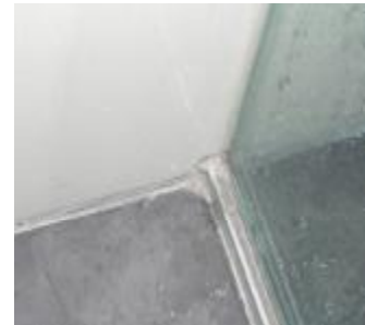
Area of Leak

Relevant Specialist - Qualified Glazier/Handyman