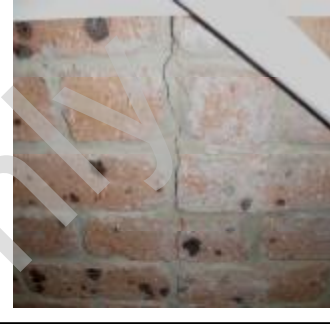
Area of Cracking

Relevant Specialist - Structural Engineer