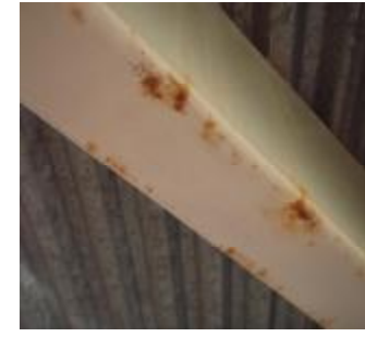
Surface Rust to Beam

Relevant Specialist - Qualified Painter/Handyman