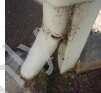
Leaks to Joins

Relevant Specialist - Licensed Roof Plumber/Handyman