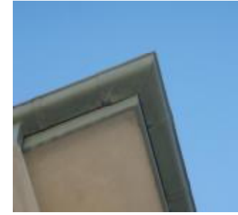
Leaks to Gutter

Relevant Specialist - Licensed Plumber/Handyman