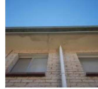
Staining to Eaves