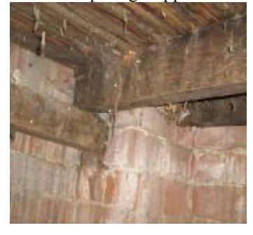
Bearer Requiring Support